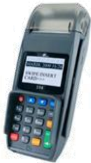
S58 Countertop – Dial-up