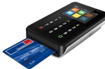
D200 Wireless POS Terminal