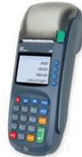
S80 Countertop Payment Terminal