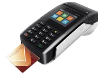
D210 Wireless POS Terminal