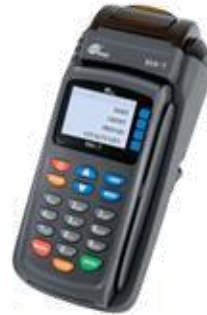
S60-T Portable Payment Terminal