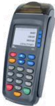
S90 Mobile Payment Terminal