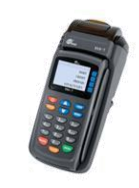
S60-T Portable Payment Terminal